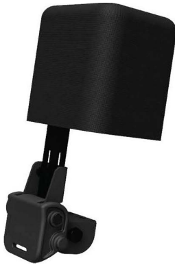
Flip-up Abductor Block